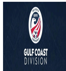
Mid-South Conference League