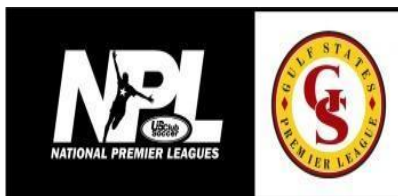
Gulf Coast State Premier League (GSPL)