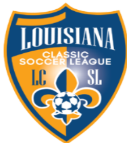
Louisiana Classic Soccer League (LCSL)