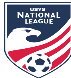
USYS National League