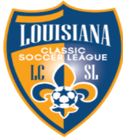
Louisiana Classic Soccer League (LCSL)