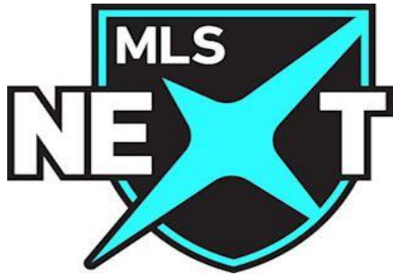
MLS Next League Tier 2