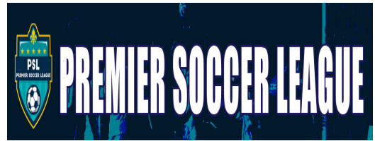
Premier Soccer League (PSL)