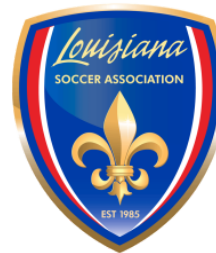
Louisiana Soccer Association (LSA)