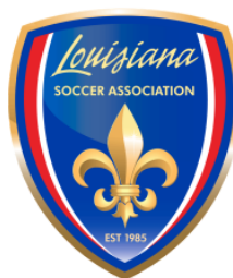
Louisiana Soccer Association (LSA)