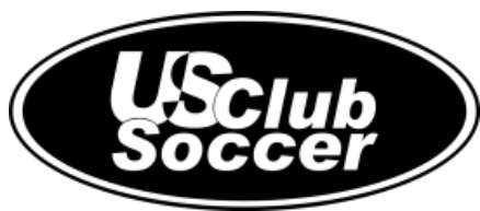
US Club Soccer