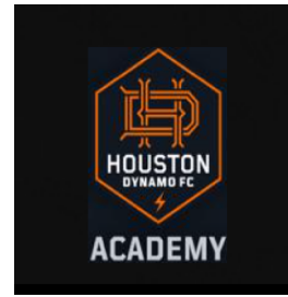
Houston Dynamo Academy