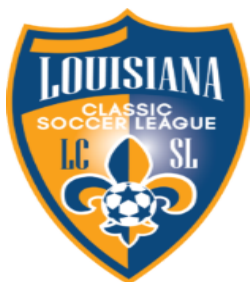
Louisiana Classic Soccer League (LCSL)