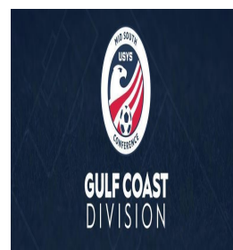
Mid-South Conference League