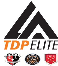
Talent Development Program (LATDP)

Through LSA, BRSC is also affiliated with Region III, which includes the following state associations: Louisiana, North Texas, South Texas, Tennessee, Alabama, Georgia, North Carolina, South Carolina, Florida, Mississippi, Arkansas, and Oklahoma. Our Competitive teams will compete in one or more of the following: