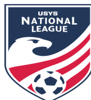
USYS National League