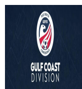
Mid South Conference League