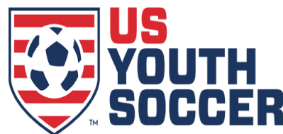
United States Youth Soccer (USYS)