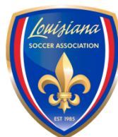
Louisiana Soccer Association (LSA)

Through LSA, BRSC is also affiliated with Region III, which includes the following state associations: Louisiana, North Texas, South Texas, Tennessee, Alabama, Georgia, North Carolina, South Carolina, Florida, Mississippi, Arkansas, and Oklahoma. Our Competitive teams will compete in one or more of the following: