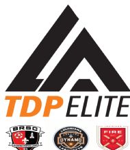
Talent Development Program